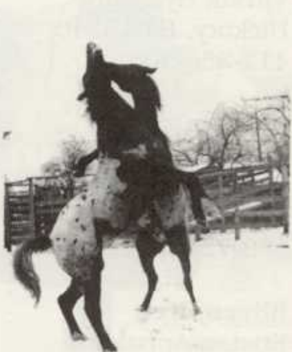
Red Thunder and Eagle Toby playing in the snow