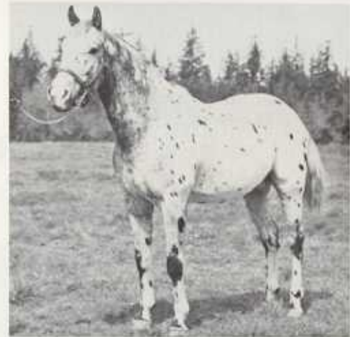
Toby II's Patchy — Age 16

Toby had a favorite spot in his corral, where he liked to lay in the sun for a nap. We found him there, in his final sleep, a month after his 30th birthday. He left behind three newborn sons, and a broken-hearted family . . . Toby . . . we miss you . . .