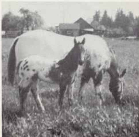
E.C. True Velvet